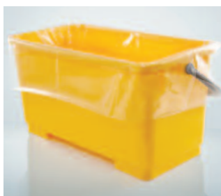
LDPE/Nylon laminate Bucket Liner in Slim T™ bucket